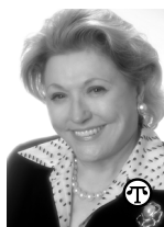
Barbara Taylor Bradford

She has an extraordinary literary record of success, including 23 novels—all best sellers—81 million books in 90 languages and 10 network TV movies.