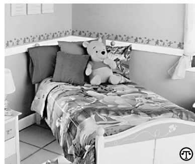
New child-inspired color palettes can help kids brush up the appearance of their rooms.

3. After the stepstool has dried thoroughly, decorate with the Bee Stamp, from the Disney Home Collection. Apply "Sunny Spot" on the surface of the Bee Stamp with a sponge stencil brush. Use only a thin layer of paint, evenly distributed on the stamp.