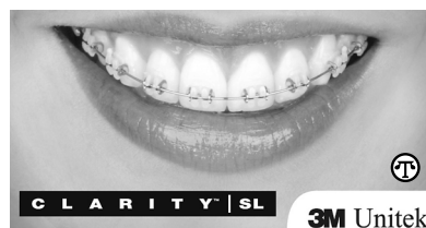
New “friction-free” braces

Another reason to consider self-ligating braces is a cleaner