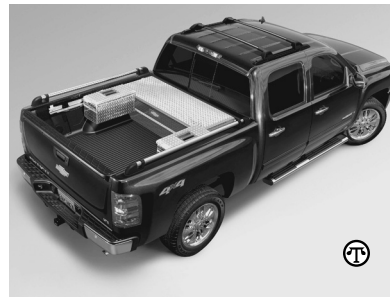
The 2007 Chevy Silverado Crew Cab can be fitted with an assortment of cargo accessories.

For a complete list, visit www.chevrolet.com or www.gmc.com .